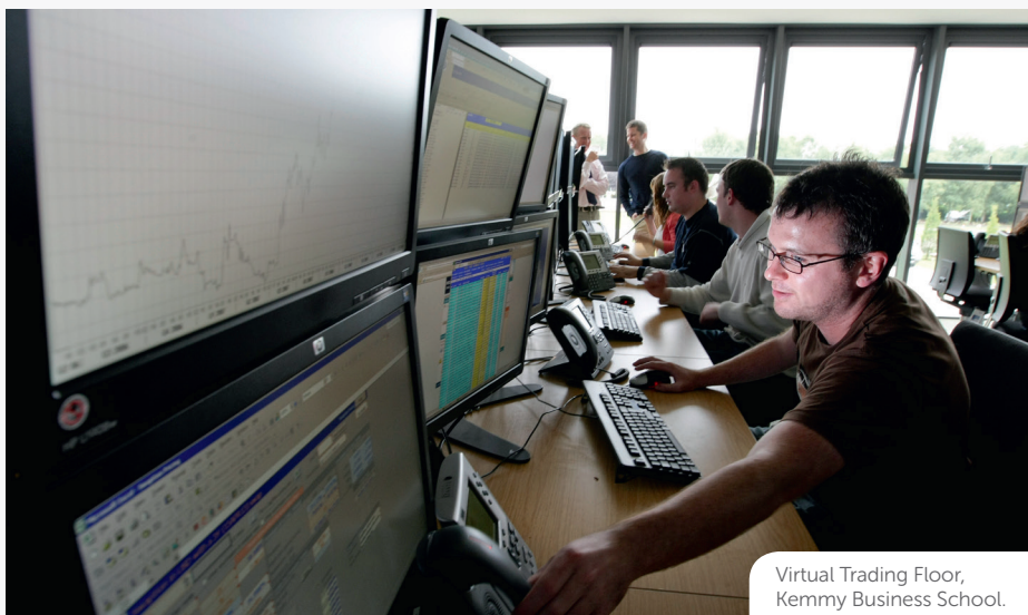
Virtual Trading Floor, Kemmy Business School.

Our research has also received widespread media coverage from outlets including the Irish Times (readership 390,000), Irish Independent (readership 649,000), Irish Examiner (readership 224,000), Sunday Business Post (readership 147,000), national radio (RTÉ), and industry/trade publications such as European Industrial Relations Observatory, Worldlink, People Management, and the Kemmy Business School Research Bulletin (Sources 22 to 29). For example our research is regularly featured in the Industrial Relations News (IRN), Ireland's only specialist weekly publication in the IR/HR field (Source 21). IRN enjoys an estimated readership of over 10,000 people: readers include members of the Department of Finance and Public Expenditure & Reform, and the Department of Jobs, Enterprise and Innovation; HR directors and senior practitioners in the public and private sectors, including union and non-union companies and organisations; senior trade union leaders and trade union officials; employment lawyers; and IR/HR consultants. The editor of IRN notes: "UL has provided the hard evidence of a trend toward union avoidance that developed from that point in the 1980s onward. Moreover, UL has maintained a sharp focus on this feature of the Irish scene, thereby providing researchers, policy makers and HR/IR professionals with the hard 'facts on the ground' on which to make decisions in this