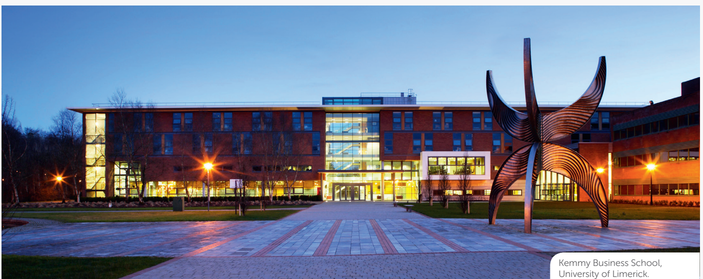
Kemmy Business School, University of Limerick.

The second project involved international research collaboration on HRM practice in American-owned MNCs: American multinationals and the management of HRM in their European subsidiaries: A four country study. This research project was funded by the Department of Enterprise, Trade and Employment and the Irish Research Council for the Humanities and Social Sciences, and involved comparative analysis across four countries (Germany, Spain, the UK and Ireland). The project focused on the ways on which human resource management innovations are transmitted to (and sometimes from)