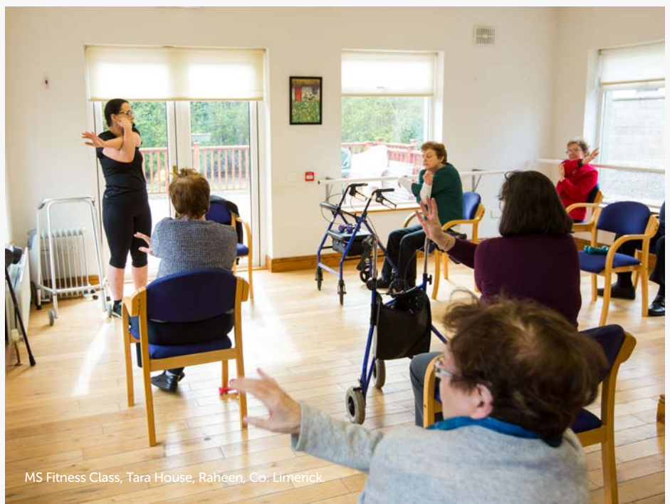
MS Fitness Class, Tara House, Raheen, Co. Limerick.

Ireland "Activity Matters" that aims to give people with MS the knowledge, skills and attitudes to successfully engage long term in exercise.