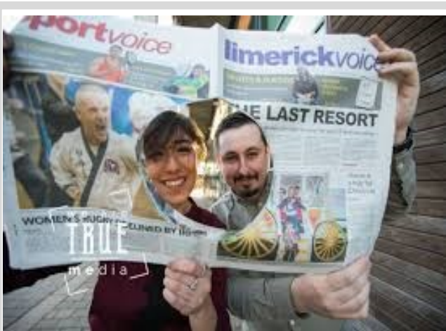
Journalism students on the Limerick Voice