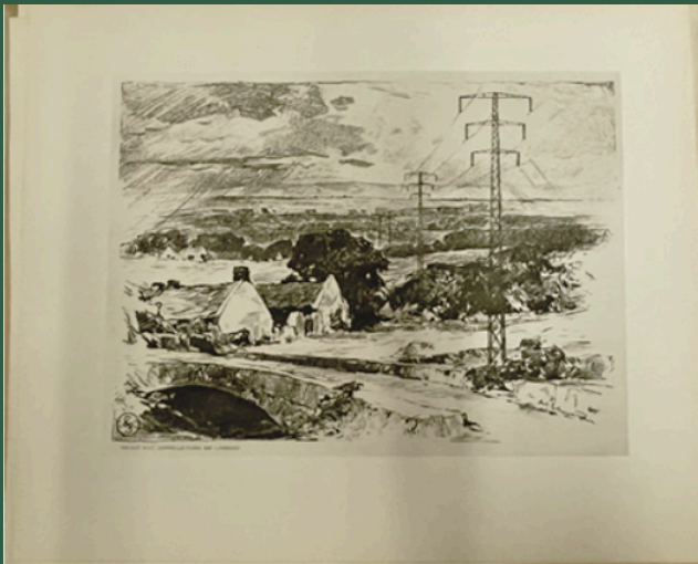
110 000 Volt Doppelleitung bei Limerick