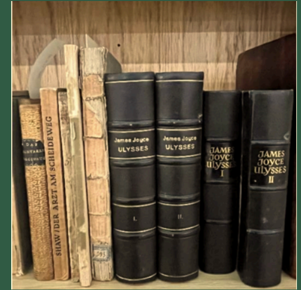
Two of the three Ulysses volumes Adapted text and photo from Nigel Rafferty

Originally published in 1922, the Gottschalk Collection boasts two of the three first edition volumes of Ulysses translated into German by Georg Goyert in 1927. It was also the first time the book had been available in a language other than English. There were only 1,100 printed copies in this run. These first edition texts are among the jewels in the treasure trove of the Gottschalk Collection.