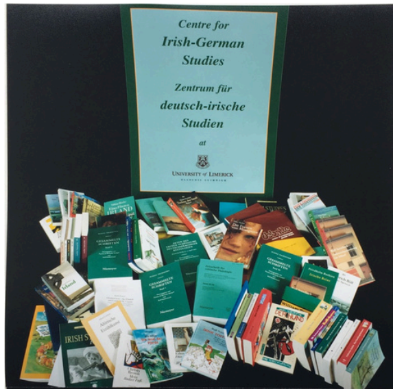
The beginning of the book collection in 1999