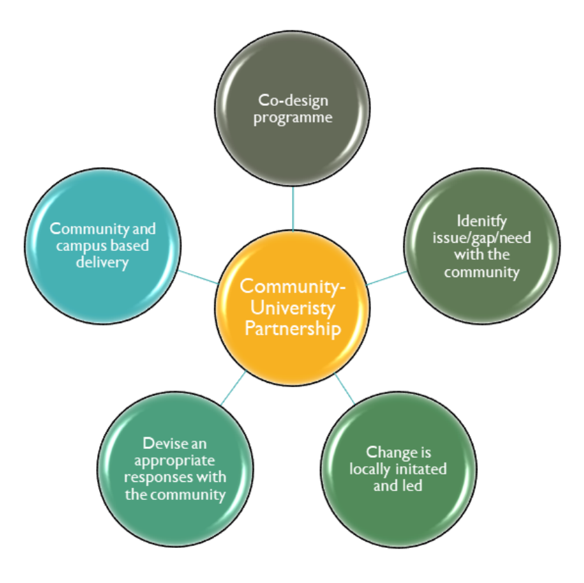
Figure 1. The CWELL Theory of Change

These are achieved through the provision of an accredited pathway to further education, an accredited first-aid course and a flexible model of delivery, over two years (full-time) or four years (part-time).