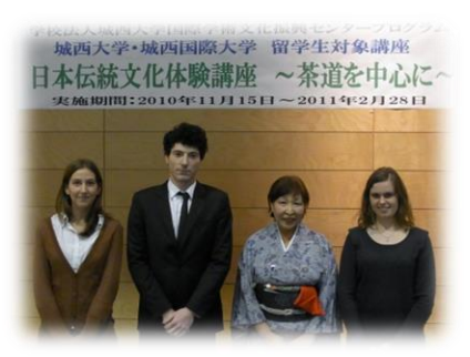
Experience Japanese traditional culture, "Sado" (Tea ceremony)

The city of Togane, where JIU is located, is approximately 50km from central Tokyo. With a population of around 60,000, this modern city is known for its winter strawberry cultivation through a network of greenhouses around the city.