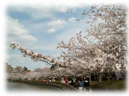
Hakkaku Lake's cherry tree