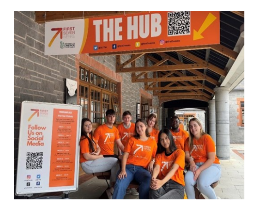
First Seven Weeks Hub Staff 2023