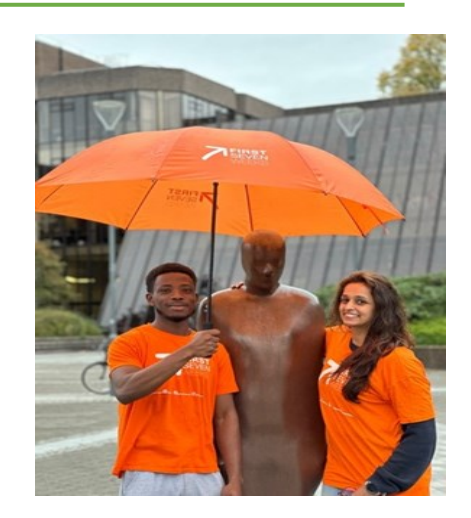
150 Directional Guides assisted students

Answered more than 1000 questions online Over 2000 responses from the First7Weeks Feedback Survey