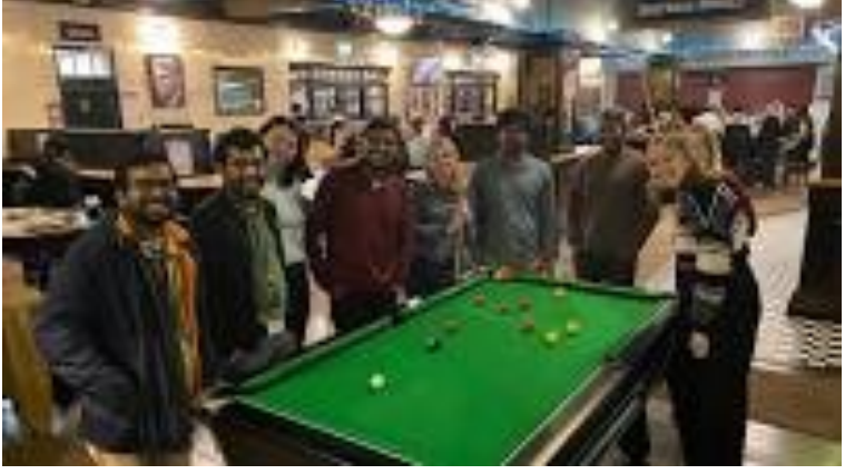
Our tutors enjoying a Christmas event