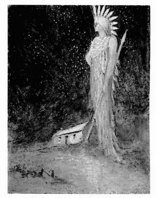
Fig.1.2 George Russell AE, A spirit or sidh in the landscape, Canvas laid on board, 25 x 19cm, National Gallery of Ireland, Presented by Mrs. F. Hart, 1973<sup>29</sup>

witnessed in vision and if the mystical effect were intense enough, reincarnated.<sup>28</sup>