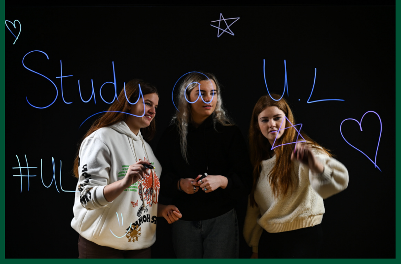
Students of Nenagh Technological College having fun on the KBS Digital Hub Lightboard at the recent Open Days in UL.

The KBS Digital Hub is a state of the art multimedia studio that aims to support, promote and research effective and innovative learning and teaching practices in the KBS. The Hub is a space where we share experience and ideas, where we innovate and create engaging multimedia content products and services that will push KBS into the future of digitalization by using the most innovative technologies.