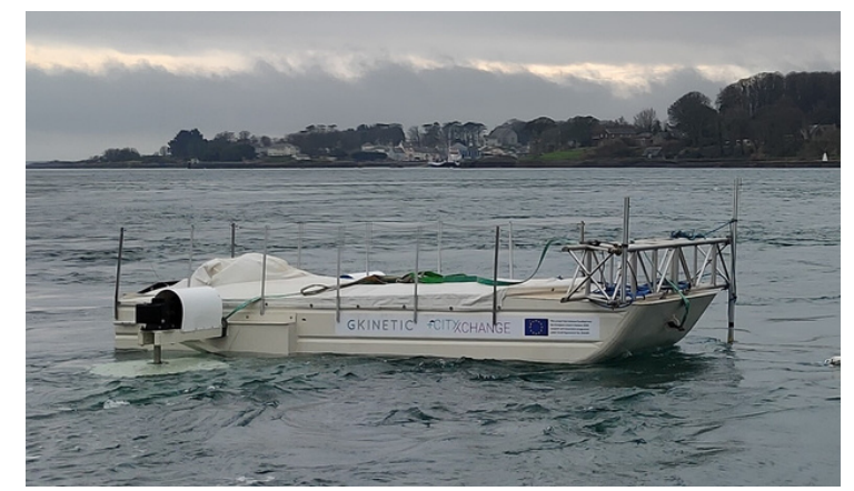
The GKinetic CEFA 12 tidal turbine at its test site in Northern Ireland.