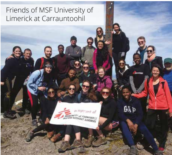
Friends of MSF University of Limerick at Carrauntoohil

The society "Friends of MSF University of Limerick" founded in GEMS recently undertook a fundraising hike to the highest point in Ireland, Carrauntoohil, the highest of the MacGillycuddy reeks at 1,038M.