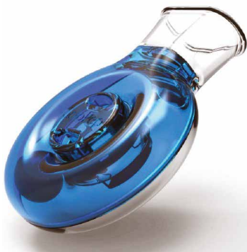
The new innovative soloPEP device