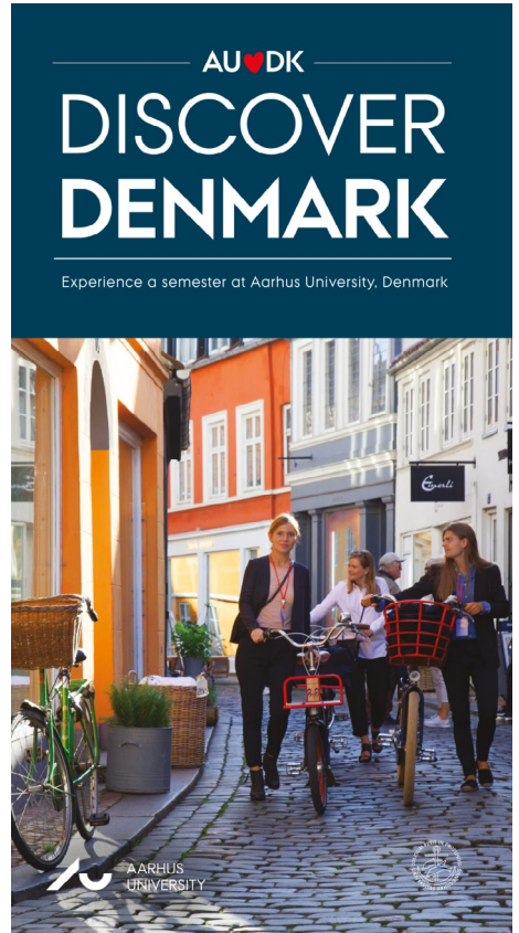
Cover page for a couple of our brochures