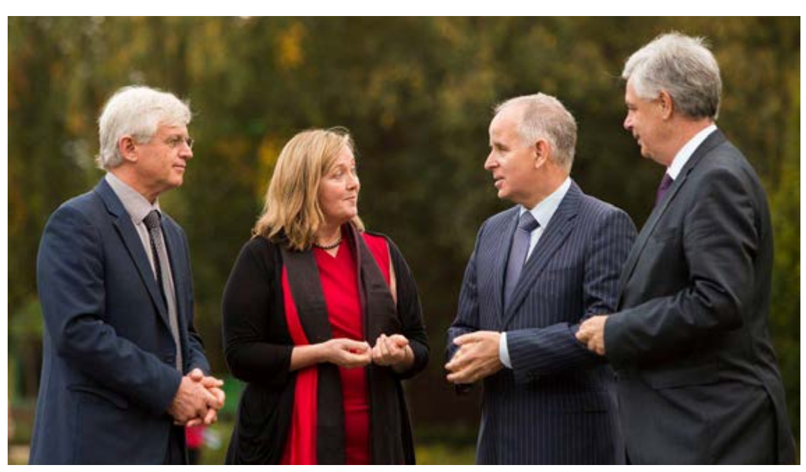
Common Good, Common Ground - Kemmy Responsible Business Breakfast.

At the same time, a meeting of the Irish Government National Stakeholders' Forum on Corporate Social Responsibility was also held in KBS, and delegates to this meeting attended some other related events. Three learning journeys, artefact , sanctuary and nomad were led respectively by an archivist of local treasures, a journalist who had sought asylum in Ireland and two members of the Irish Traveling Community. The week concluded with the first conference of a new network of Social and Environmental Accounting researchers in Ireland, presenting work with a particular focus on accounting and the common good, and facilitating the exchange of ideas on how accounting and accountability can progress the UN SDGs.