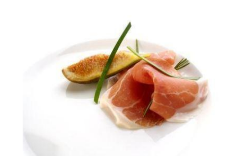
Kraški pršut (The Karst Prosciutto)