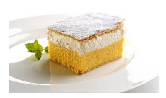
Bled cream cake