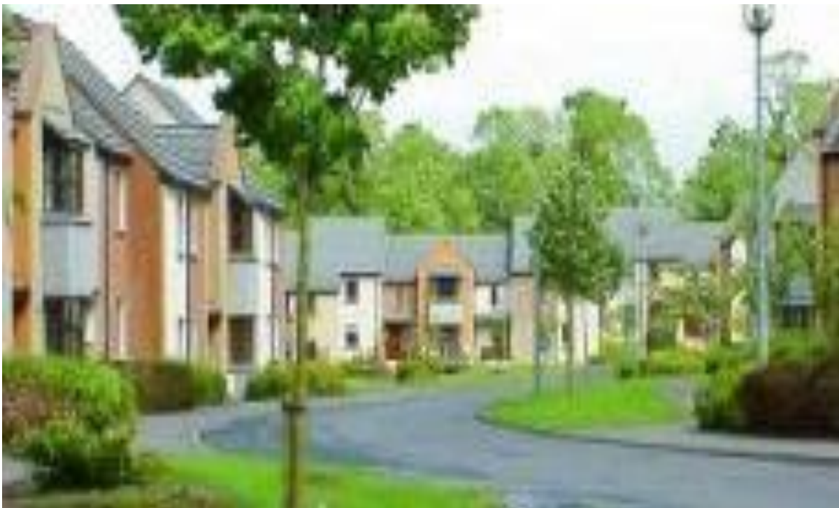
Kilmurry Student Village