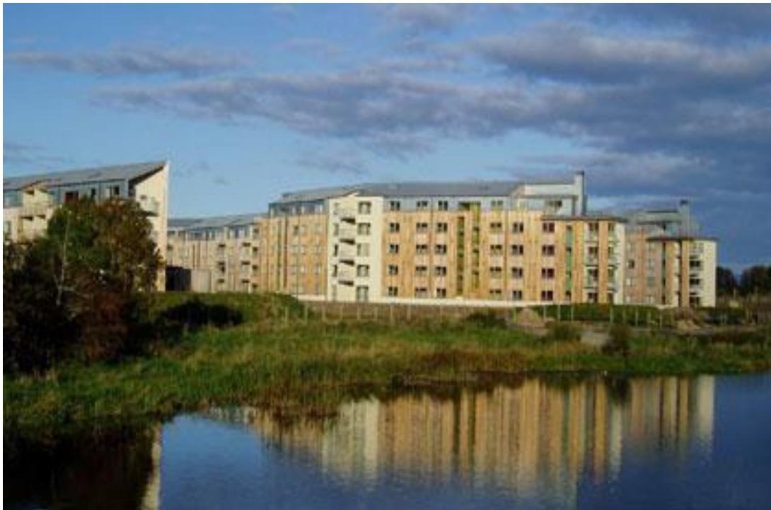
Thomond Student Village