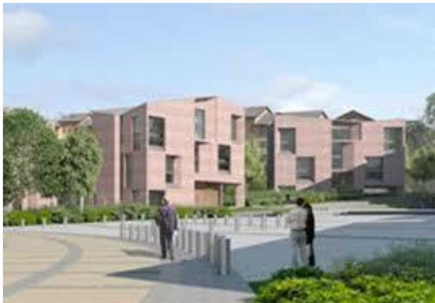
Quigley Residence UL