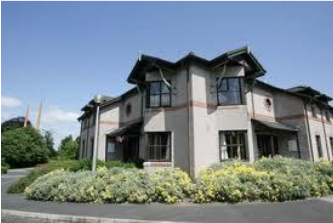
Plassey Student Village