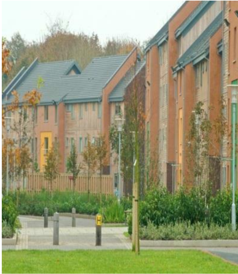
Dromroe Student Village