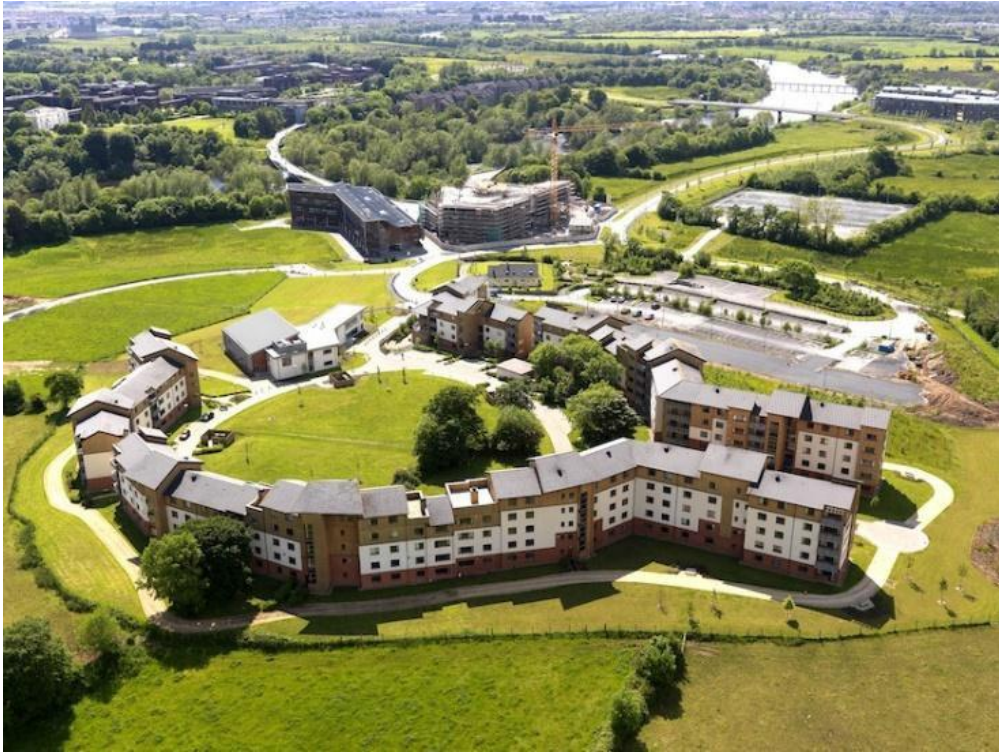
Cappavilla Student Village