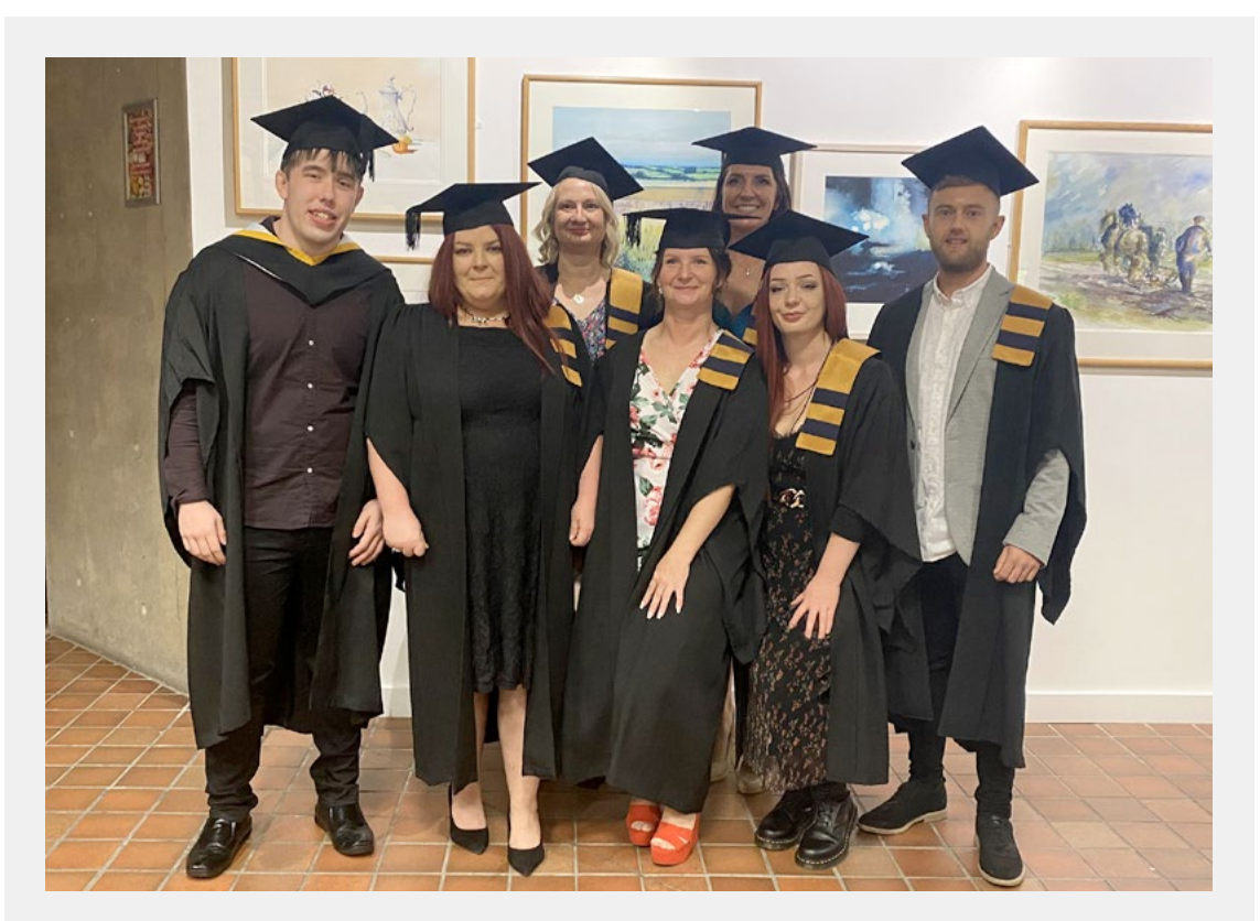
Pictured above: Graduates of the Mature Student Access Certificate (MSAC).