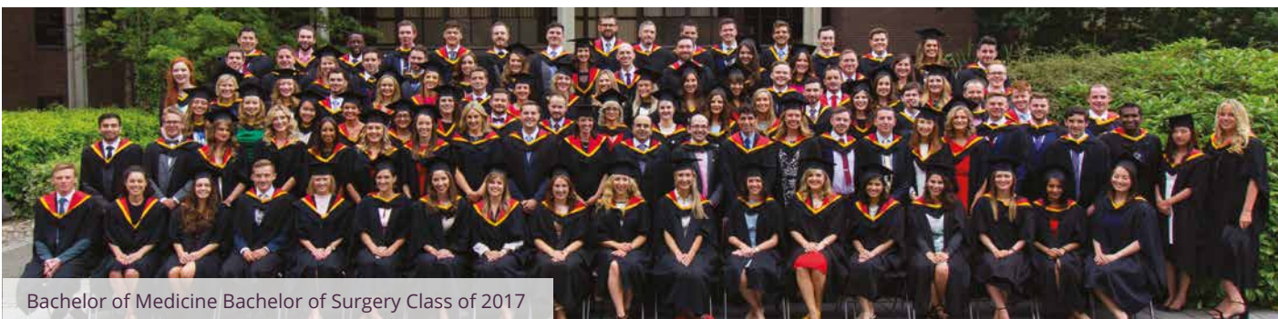
Bachelor of Medicine Bachelor of Surgery Class of 2017