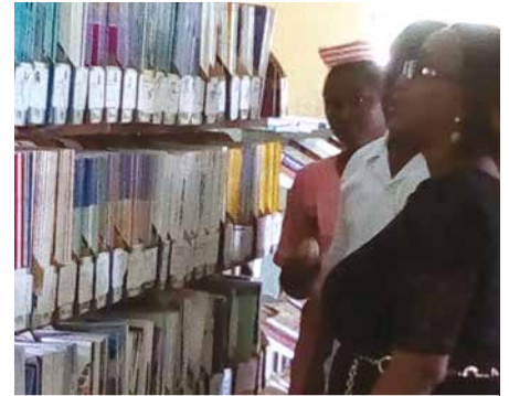
Students of Njala University exploring the titles of the journals donated from University Hospital Limerick Post Graduate Library