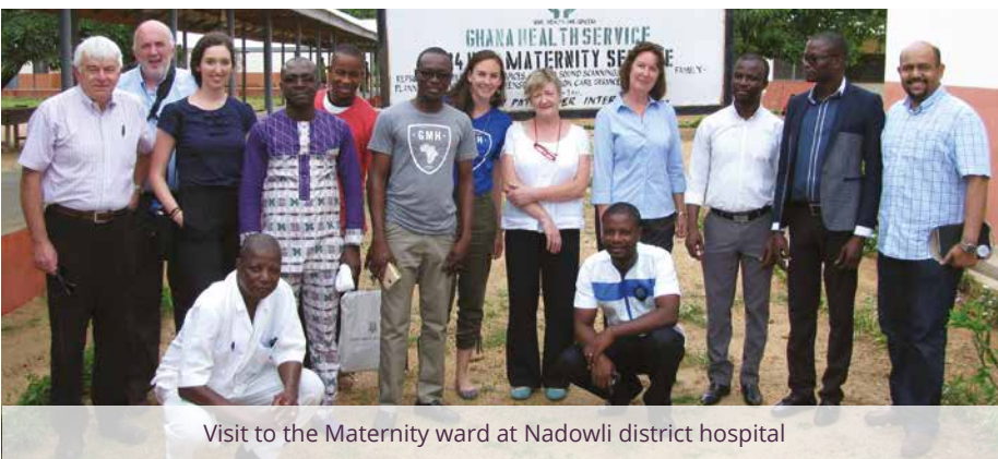
Visit to the Maternity ward at Nadowli district hospital