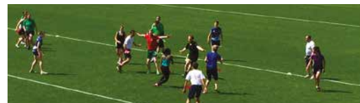
The GEMS tag rugby team in action at the Pavilion complex.