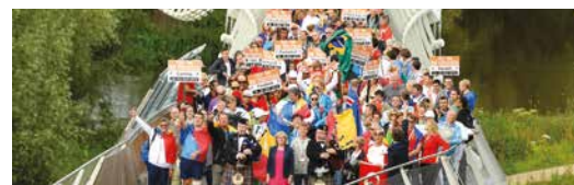
The 36th World Medical and Health Games was officially opened by Minister Jan O'Sullivan TD at the University of Limerick on Sunday 19th July.