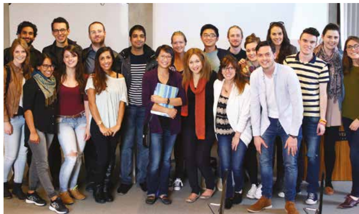
UL GEMS Medical students at Health Equity Program team meeting