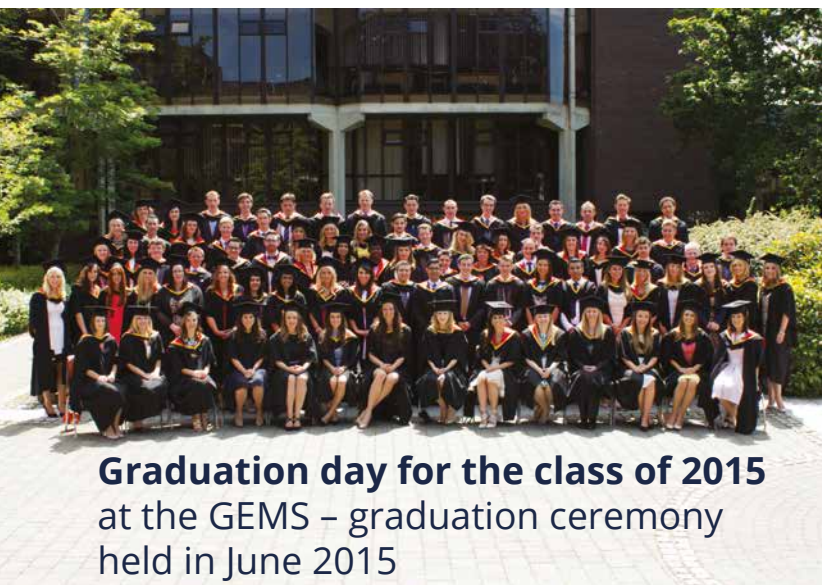
Graduation day for the class of 2015 at the GEMS – graduation ceremony held in June 2015